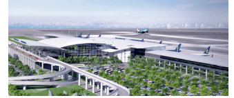
Noi Bai International Airport in Hanoi, Vietnam